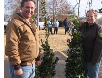
Volunteers from Chesapeake Energy; the City of Oklahoma City Department of Parks, Planning and Public Works; and the Oklahoma State Department of Forestry join forces to plant 176 Tree Bank trees in the Douglas Edgemere and Helm Farm neighborhoods.

As Oklahoma City grows bigger, it also grows greener, thanks to NeighborWoods, a program of the City of Oklahoma City Planning Department, whose mission is to facilitate tree planting projects in low-to-moderate income neighborhoods by connecting businesses, who donate the trees, with city residents, who plant and maintain them.